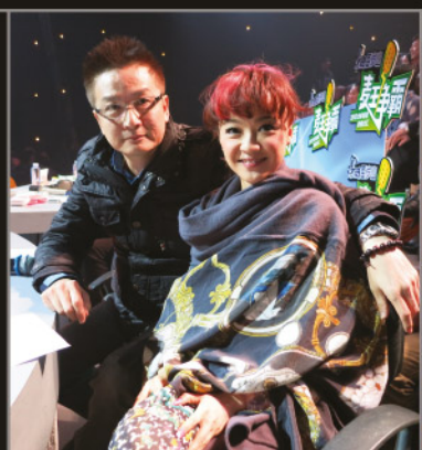
和陳慧嫻在內地歌唱節目《咪王爭霸》任嘉賓 As guests of the mainland's singing contest King of Mic with Priscilla Chan