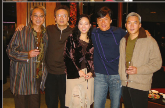
出席 (中) 陳秋霞的宴客聚會 At a party hosted by Chelsia Chan (M)