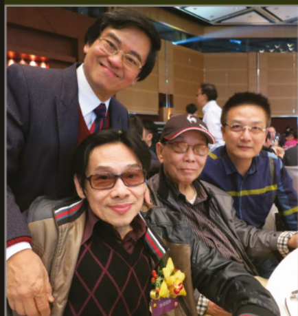
與鄭國江、泰迪羅賓及顧嘉輝在CASH週年晚宴上聚首 Pictured with Cheng Kok Kong, Teddy Robin and Joseph Koo at the CASH Annual Dinner