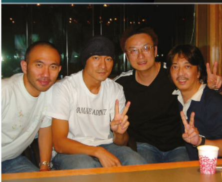
劉德華為《家鄉的龍眼樹》（健康快車2005主題曲）錄音，作品由向雪懷及陳秋霞作詞。Andy Lau recorded "Longan Tree of the Homeland" (the theme song of Lifeline Express 2005) with lyrics written by Jolland Chan and Chelsia Chan.

Years later, lyrics I wrote for Alan Tam's "Yu Si Qing Chou (Drizzling Rain, Love's Sorrow)" won me my very