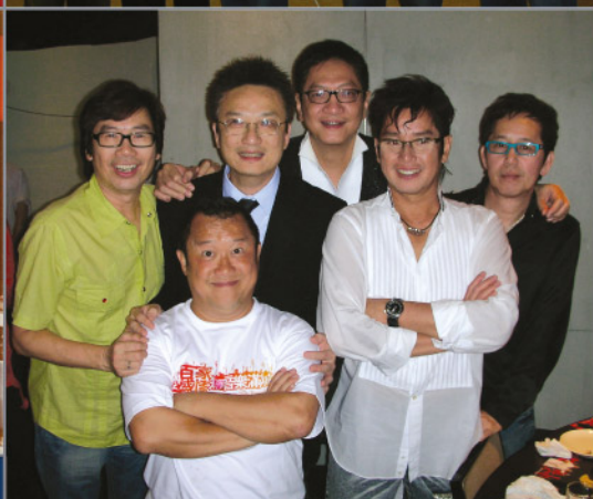
與曾志偉及溫拿樂隊四位成員在陳秋霞慈善演唱會喜相逢 Pictured with Eric Tsang and The Wynners at Chelsia Chan's charity concert