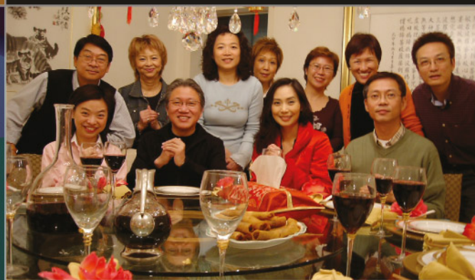
與寶麗金高層、同事及歌手鄭美雲新年聚會 At a Chinese New Year gathering with PolyGram's management, colleagues and singer Cally Kwong